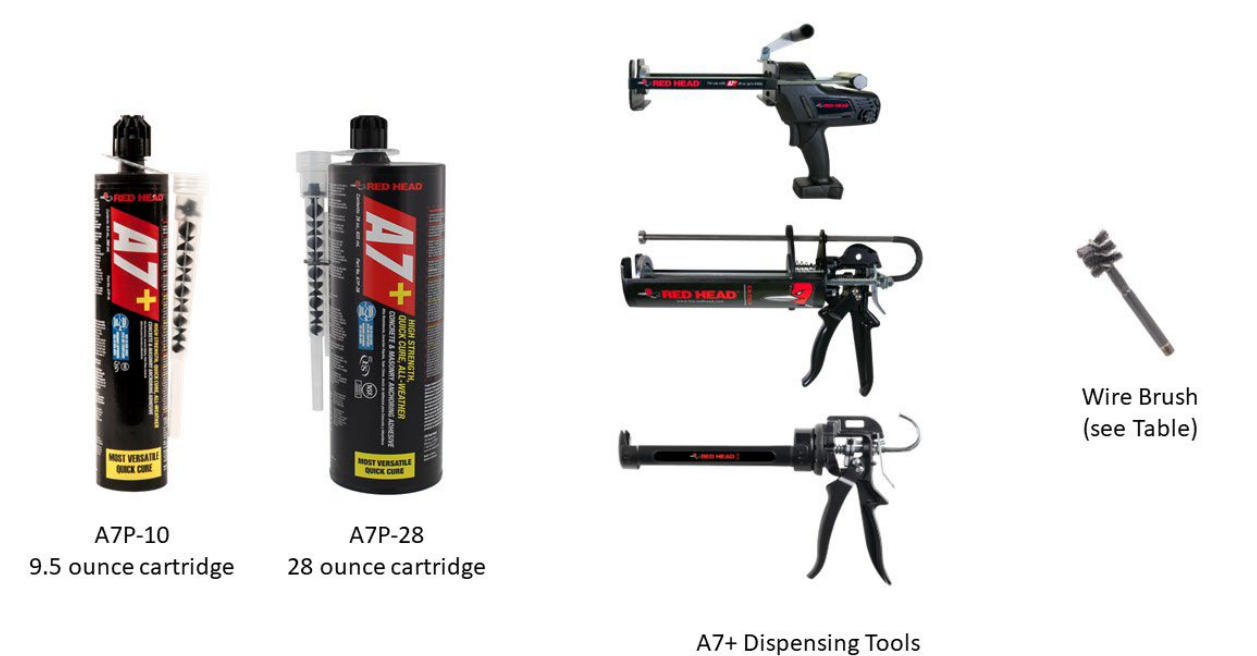
FIGURE 3 -- RED HEAD A7+ ADHESIVE ANCHORING SYSTEM COMPONENTS CONSISTING OF CARTRIDGES, DISPENSING TOOLS, AND CLEANING BRUSHES

Originally Issued: 01/16/2024 Valid Through: 01/31/2025