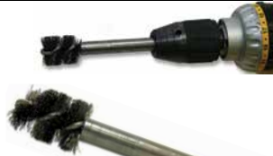
1/8" NPT (National Pipe Thread Taper)

Proper hole cleaning using a brush is essential to achieve optimum performance